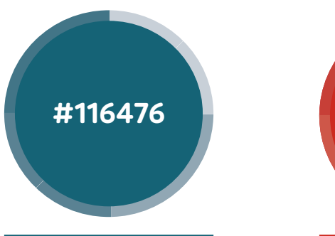
C: 86 M: 42 Y: 38 K: 25 R: 17 G: 100 B: 118